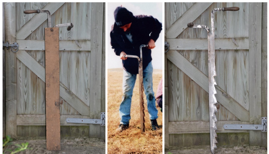
Figure 1: Stainless-steel peat-cutter, showing safety-sheath (left) and field use (center); its sharp edge (right) ensures a clean cut, and minimal environmental damage.

In South Wales, it was acknowledged that many upland mires and moorlands are depauperate, lacking some typical mire plants, particularly some of the bog moss species. This was variously attributed to overgrazing, too-frequent burning, airborne pollution, peat erosion, and climate change, among other causes. In many localities, Molinia was dominant.